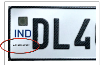
Rear Laser Code