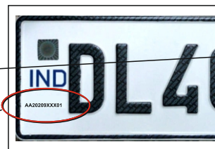
Front Laser Code